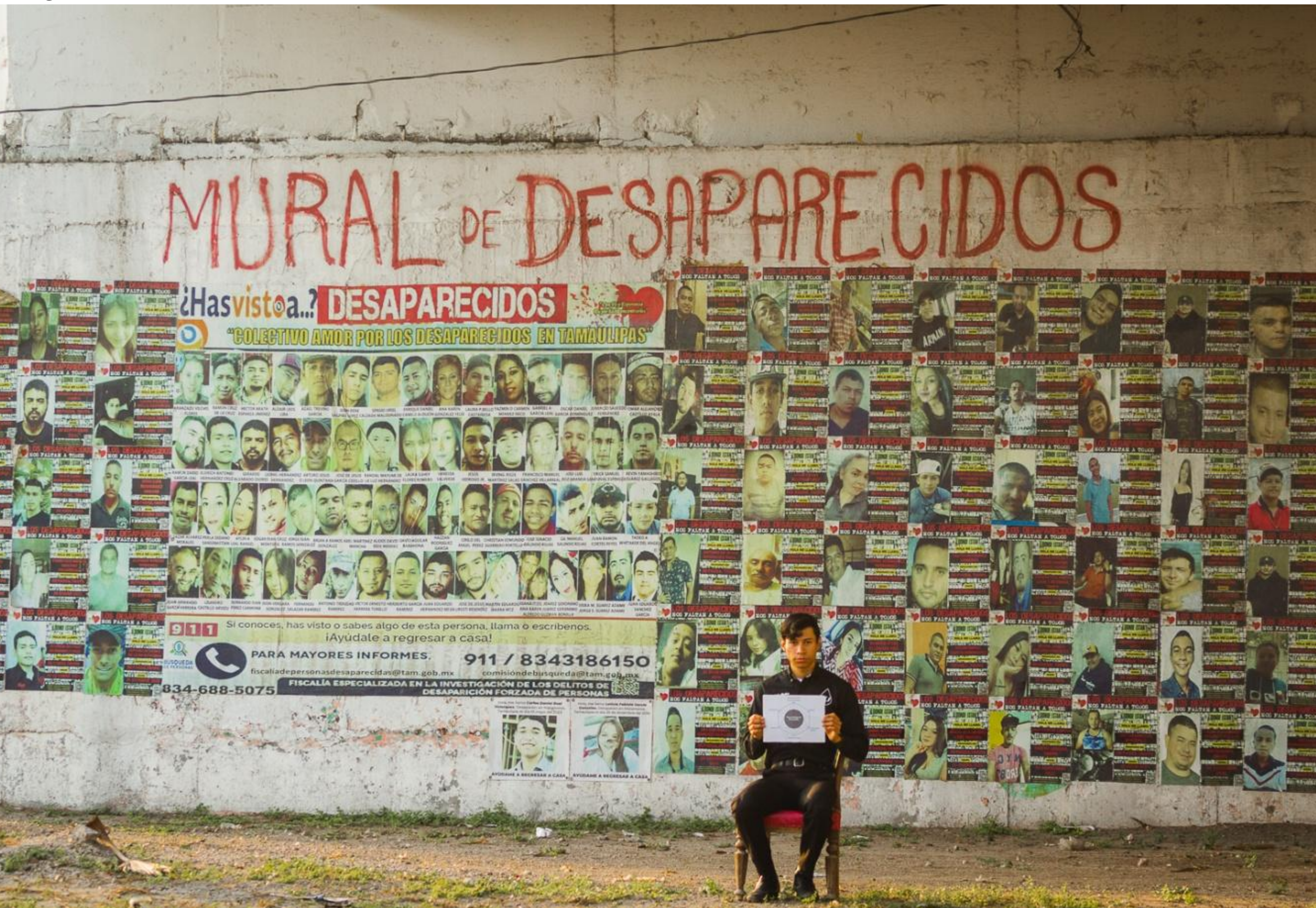
Note. Photograph provided by an anonymous participant to ensure their safety. (Personal communication , 2026).